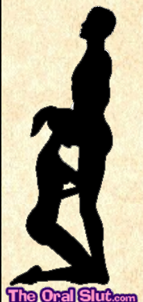
The Oral Slut.com